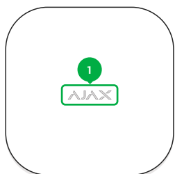
1 - Logo with a light indicator.