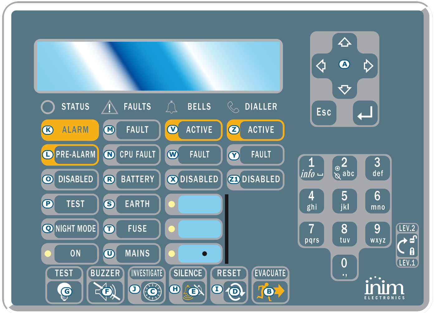
Figure 2 - Front view of the repeater panel

Connected repeater panels replicate all the information provided by the control panel and allow access to all Level 1 and 2 functions (View active events, Reset, Silence, etc.), but do not allow access to the Main menu.